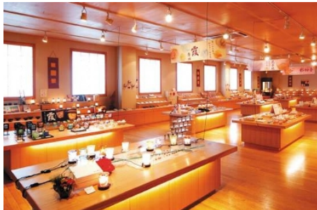
Glass wear factory shop