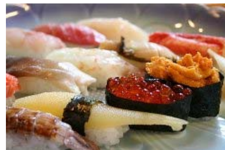
Shall we cook Sushi?