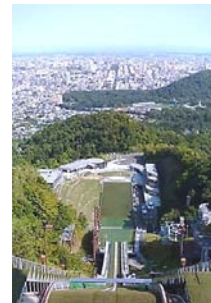
Ski jump stadium