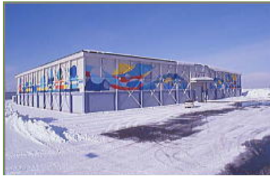
Snow cooling facility